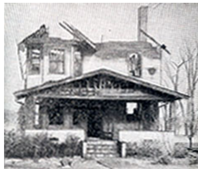
Clark home in Milan, Illinois.