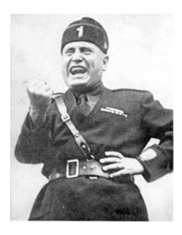
Benito Mussolini "We have 8 million bayonets"

Vatican City State is a Government within a Government. Its head—the Pope—is not even elected by the residents of the state. It is not subject to the lawful rulers in Italy. It has its own police force, post office, radio station, publishing house, TV station, and ambassadorial staff. The Papal ambassadors are called Nuncios or Legates. They are assigned to any country of the world that will accept them and recognize them as Deans of the Diplomat Corps —above every other diplomat.