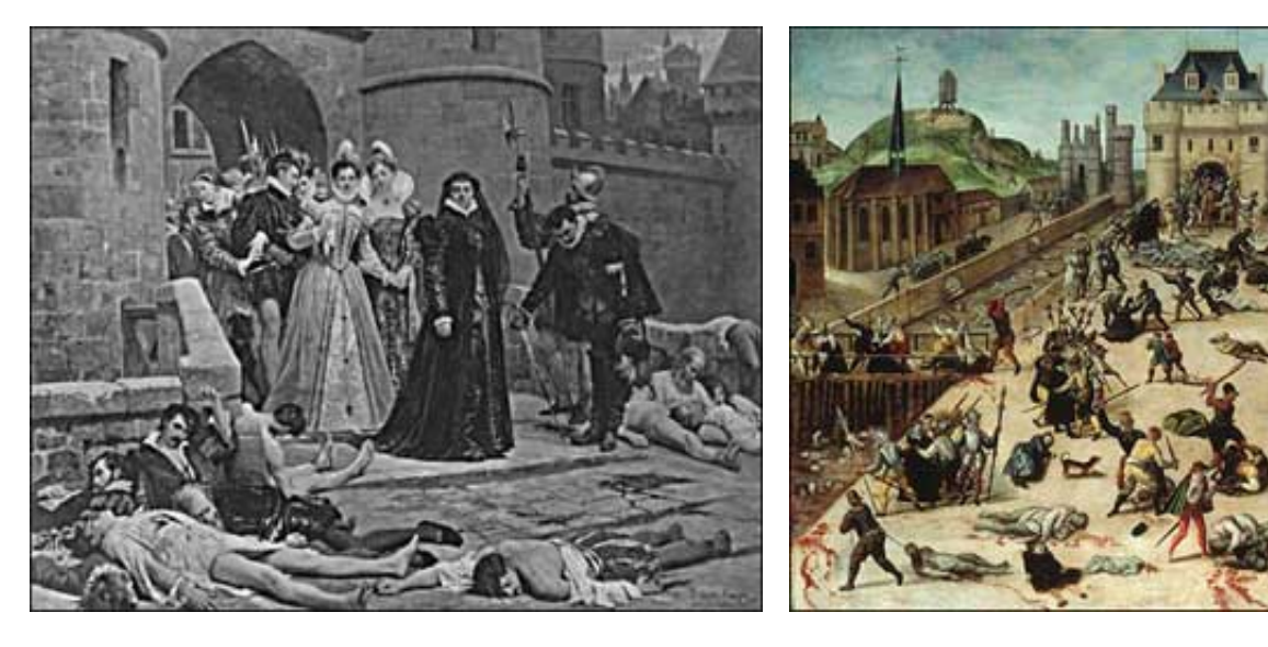
Scene from the massacre of the Huguenots in Paris.

Many were imprisoned—many sent as slaves to row the king's ships—and some were able to escape to other countries.... The best and brightest people fled to Germany, Switzerland, England, Ireland and eventually the United States, and brought their incomparable manufacturing skills with them.... France was ruined.... Wars, famine, disease and poverty finally led to the French Revolution—the guillotine—the Reign of Terror—the fall of the Roman Catholic monarchy—atheism—communism, etc., etc.