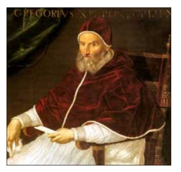
Gregory XIII (1572 to 1585)