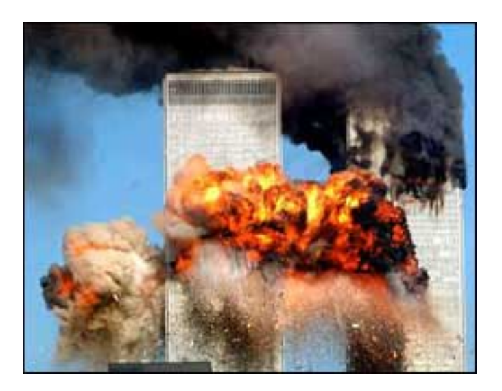
The evil Twin Towers were demolished

Here we go again.....The Rockefeller, Rothschild, Roosevelt cabal producing more fake terror to destroy what is left of the U.S. Constitution.