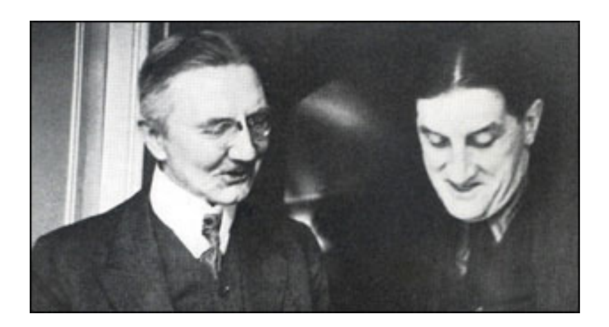
Hanfstaengl with Hitler's banker

He was indicted for war crimes at Nuremburg but his friends in high places had him acquitted while the other criminals were hanged.