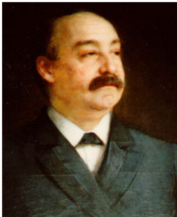
Charles Joseph Bonaparte, Attorney General from 1906 to

Another Bonaparte. . . .to destroy the Cabotian Republic....This man was the grand nephew of the Emperor and attorney General under Roosevelt from 1906 to 1909.