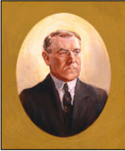
Woodrow Wilson. President from (1913-1921).

College Professor Woodrow Wilson was a real tool of the Jesuits. In Oct. 1913, he signed the Income Tax Amendment into law. This tax was an exact duplicate of the Pope's tax on his slaves during the darkest time of the Dark Ages: