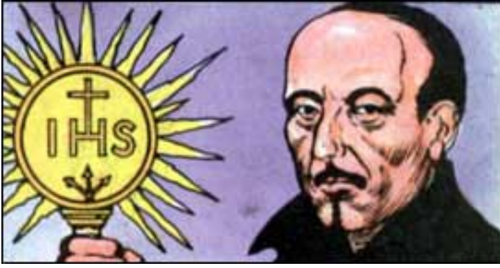
Ignatius LIEola (1491-1556). Co-founder of the Jesuits.

The alien force was founded by Ignatius LIEola on August 15, 1534, to fight the Glorious Reformation of Saint Martin Luther which began on Oct. 31, 1517, with the posting of the 95 Theses on the congregation door at Wittenberg, Germany.