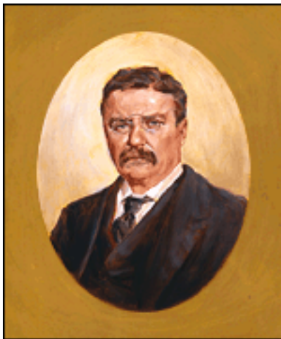
Theodore Roosevelt. President from 1901-1909.

HARVARD "educated" Teddy Roosevelt became President when our beloved President William McKinley was assassinated.