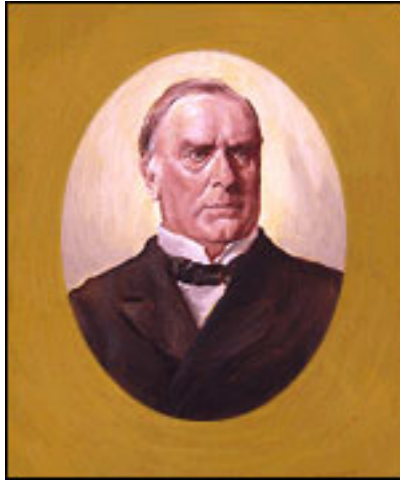
William McKinley President from 1897-1901.

President William McKinley (another great Scot) and a Civil War hero was the last really genuine Christian and Rome-free President. He was assassinated by a Jesuit assassin named Leon Czolgosz on Sept. 6, 1901.