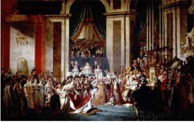
Pope Pius VII crowning Napoleon Emperor of France.