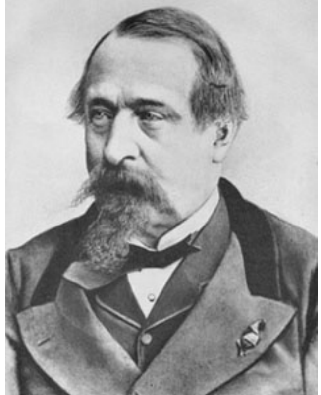
Napoleon III, Emperor of France (1852-1870).

This man was Emperor of France during the U.S. Civil War. He was the nephew of Napoleon Bonaparte and was the main prop of the Pope's temporal power. He had 5,000 soldiers garrisoning the Papal States. With the fall of the Papal States in 1870, the Jesuits told their slaves to emigrate to the U.S. and take over this great Republic in order to restore the fallen Papal kingdom in Italy.