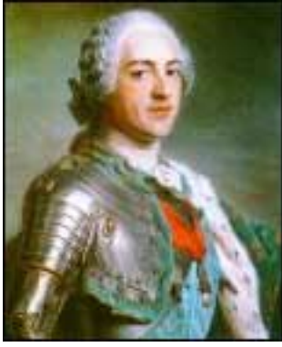
King Louis XV. 1710 to 1774. King of France from 1715 to 1774.

The 7 Years' War cost France her colonies in the New World and in India.