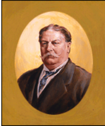
William Howard Taft. President from 1909 to 1913.

President Taft refused to go along with the unconstitutional imperial Presidency of his predecessor so Roosevelt decided to have him removed.