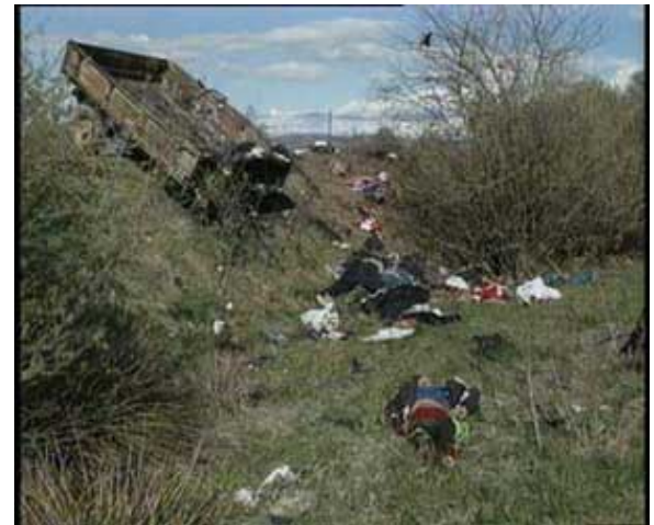
More civilians massacred by the Pentagon.

Operation Allied Farce killed everything that moved on the ground in Serbia but most of the victims were women and children: