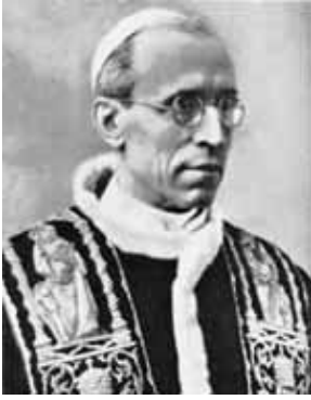
Eugenio Pacelli (1876-1958). White Pope from 1939 to 1958.

Fanatical Fatima crusader Pope Pius XII declared war to the death with all of Rome's enemies.