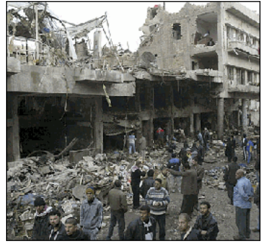
Destruction from the bombing of Baghdad.

Like Belgrade in 1999, Baghdad began to suffer the ire of the Jesuit controlled Pentagon when that nation was bombed and invaded in March, 2003.