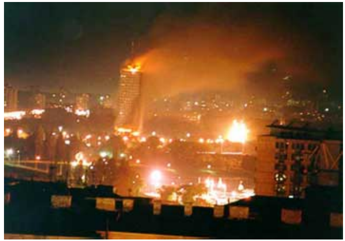
The Pentagon bombed Belgrade in 1999.

In 1999, the Pentagon began a brutal air campaign against Yugoslavia entitled Operation Allied Force (FARCE) which lasted from March 24 to June 10. Of course the Serbs were demonized by the Pentagon controlled press and they were accused of committing horrible atrocities against the Kosovo Albanians.