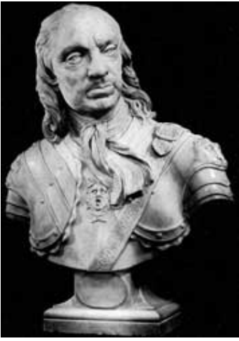
"Lord Protector" Oliver Cromwell.