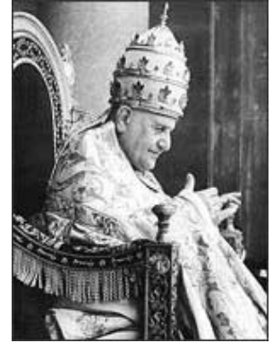
"Good Pope" John XXIII (White Pope from 1958 to 1963).

Pope John XXIII replaced him and launched Vatican Council II.