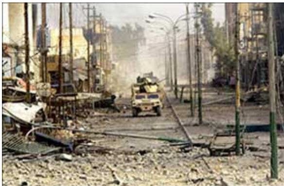
Total destruction of beautiful, historic Iraq.

The Pentagon began a reign of total destruction and terror in beautiful, historic Iraq—the birthplace of civilization: