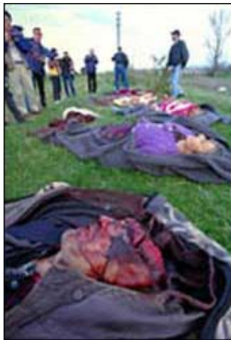
Most of the victims in the brutal air attacks were civilians.