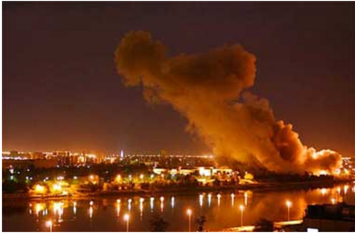
Bombing of Baghdad in March 2003.

Before the bombing and invasion, Saddam Hussein and the Iraqi people were demonized by the Pentagon controlled press, just like the Dutch centuries earlier, and the Serbs in 1999.