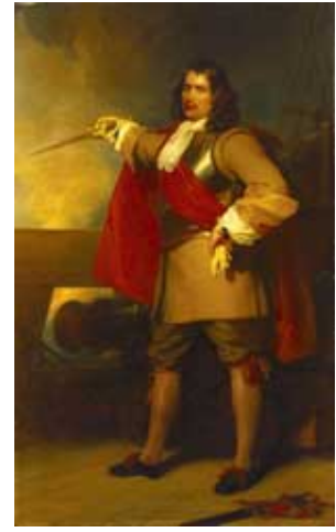
General at Sea Robert Blake.

The Jesuits managed to demonize the Dutch in England by engineering the 1623 Amboyna "massacre" in which the Dutch were supposed to have massacred 20 Englishmen in the Far East.... It was used to great effect for propaganda purposes by the Jesuits to sell their war of aggression against heroic Holland. We see this technique used by them time after time in the succeeding centuries.