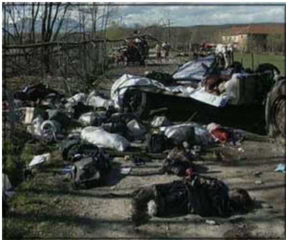
Civilians massacred by Pentagon.

In 1999, the Pentagon began a brutal air campaign against Yugoslavia entitled Operation Allied Force (FARCE) which lasted from March 24 to June 10. Of course the Serbs were demonized by the Pentagon controlled press and they were accused of committing horrible atrocities against the Kosovo Albanians.