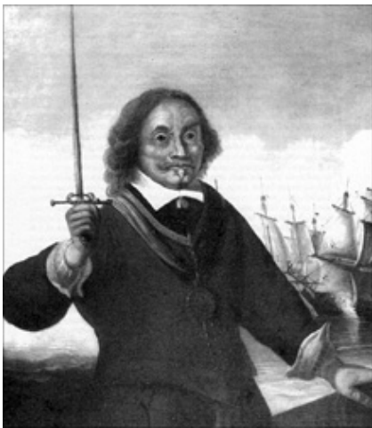
Heroic admiral Maarten Tromp.

The Jesuits managed to demonize the Dutch in England by engineering the 1623 Amboyna "massacre" in which the Dutch were supposed to have massacred 20 Englishmen in the Far East.... It was used to great effect for propaganda purposes by the Jesuits to sell their war of aggression against heroic Holland. We see this technique used by them time after time in the succeeding centuries.