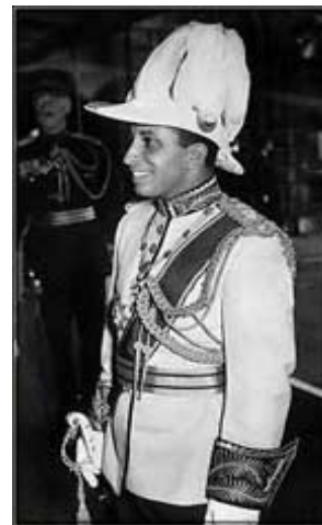
British educated King Faisal II of Iraq (1939-1958). Reigned from 1933 to 1958.

Friendly relations always existed between Iraq and the U.S. until the creation of the state of "Israel" in 1948.