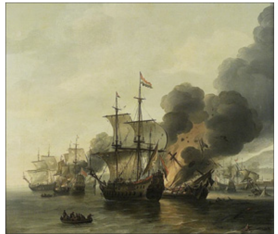
The battle of Leghorn was fought on March 4, 1653.

Heroic admiral Maarten Tromp was killed by an English sharpshooter at the battle of Dungeness in 1653.