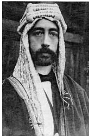
King Faisal I (1883-1933). Reigned from 1920 to 1933.

Iraq is the cradle of civilization, and was the birthplace of Abraham—the father of the faithful.