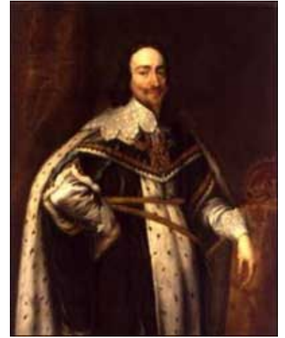
King Charles I (1600-1649). King from 1625 to 1649.

His son, Charles I, was beheaded by Cromwell's standing army in 1649 as a warning to subsequent kings to obey the Jesuits . . . or suffer the same fate!!