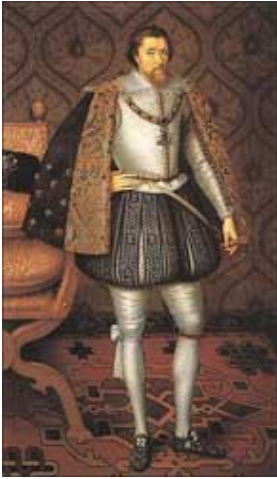
King James I (1567-1625). King of Great Britain from 1603 to 1625.

Elizabeth was succeeded by James VI of Scotland and Jesuit tactics changed completely with his ascension. Invasion from the outside was abandoned in favor of the Trojan horse ecumenical strategy.