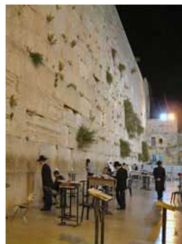
Fake Jews "pray" before the remains of the temple of Jupiter.

The Romans renamed Jerusalem Aelia Capitolina and built a temple dedicated to Jupiter Capitolinus on the very spot where the Wailing Wall is located today.