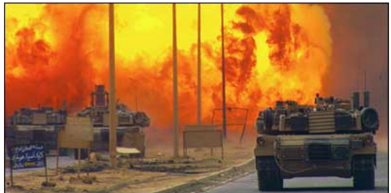
Iraq was turned into a HELL on earth by the Pentagon.

There were many reasons for the destruction of Iraq but the main reason was to ensure the survival of the state of "Israel."