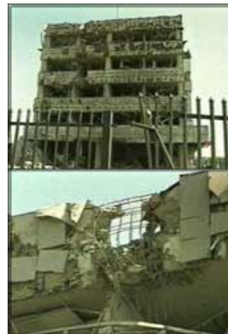
Another view of the bombed embassy.

On May 7, 1999, the Pentagon bombed the Chinese embassy in Belgrade, killing 4 Chinese diplomats, including 2 newlyweds.