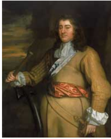
General at Sea George Monck.