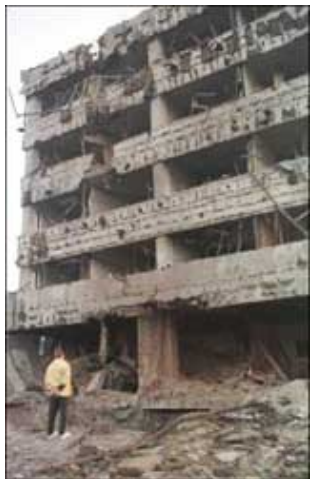
Bombed Chinese embassy.

Nothing was sacrosanct in Belgrade and the Pentagon targeted hospitals and embassies of foreign countries. Under international law, bombing an embassy is considered an act of war against that country: