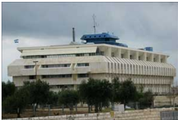
Bank of "Israel" in Jerusalem.

"And as many as walk according to this rule, peace be upon them, and mercy, and upon the ISRAEL OF GOD." (Galatians 6:16).