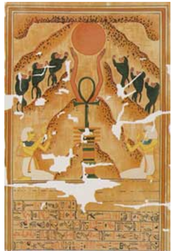
Baboons worshipping the SUN with the Egyptian cross in the center.

"This "wisdom" descendeth not from above, but is earthly, sensual, devilish." (St. James 3:5).