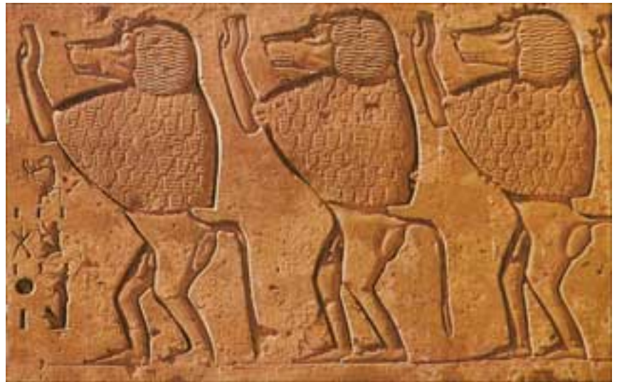
Baboon gods worshipping the sun.