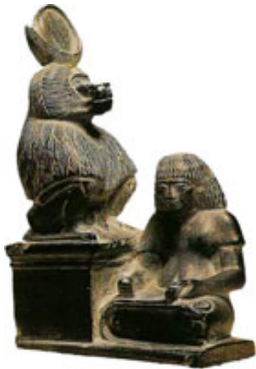
The baboon god Thoth was the Egyptian god of "wisdom".