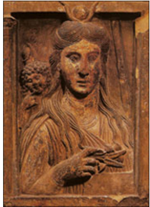
Ritual stele of the goddess Isis shown in typical Greco-Roman manner and with only the small horns and sun disk on her head directly betraying her Egyptian origin.