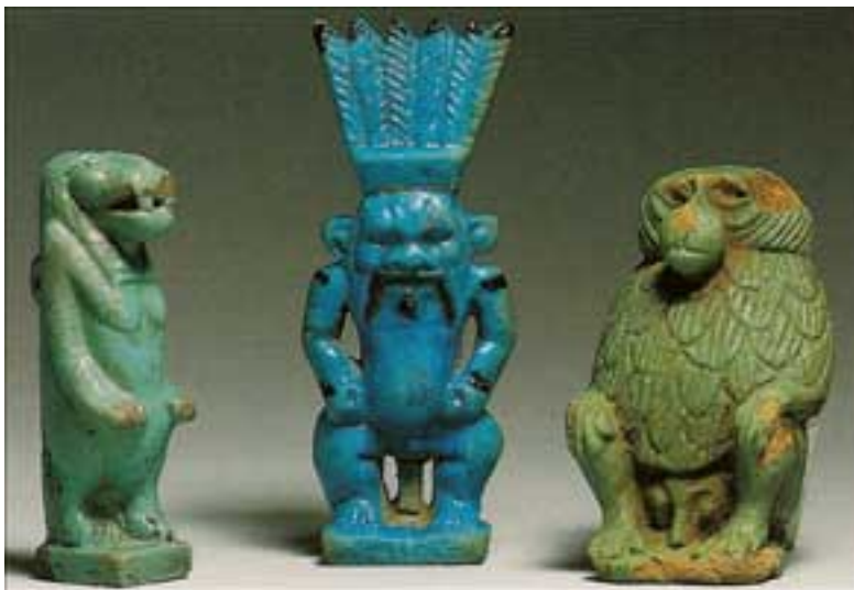
3 Egyptian demons: the goddess Taweret, the god Bes, and the god Thoth in baboon form.

"This "wisdom" descendeth not from above, but is earthly, sensual, devilish." (St. James 3:5).