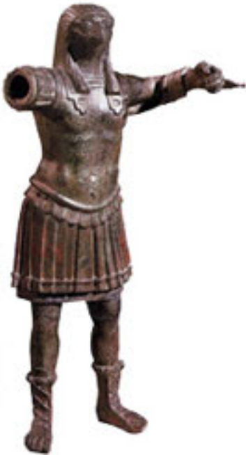
Bronze statue of the god Horus in the dress of a Roman soldier, circa 1st century A.D.

The mighty Roman legions conquered the known world but they were POWERLESS against the Satanically inspired Egyptian mother goddess religion. Only the Sword of the Spirit, which is the Word of God, can defeat the unseen hosts of darkness. By persecuting and killing the Christians, the Caesars guaranteed the ascendancy of the Isis and Horus cult and the eventual replacement of pagan Rome with something FAR WORSE— Papal Rome!!