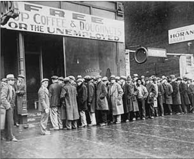
Bread lines during the Great Depression.

The second act of revenge for the rejection of Al Smith was the Wall St. Crash of October 1929. The Jesuits planned to destroy the U.S. economy and ruin small publishers like Mr. Clark.... Before the crash there were thousands of Protestant publishers but the Great Depression caused most of them to close.