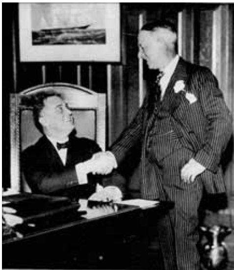
Smith congratulates Roosevelt as he takes over as governor of New York State in 1929.