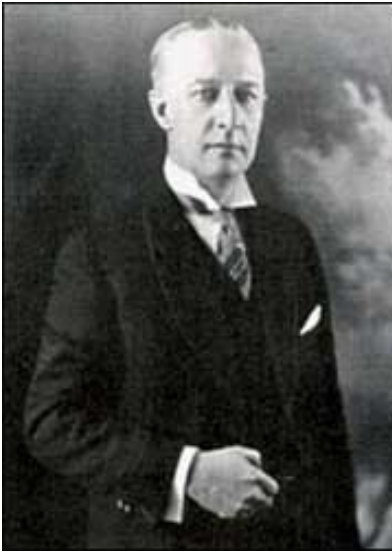
Governor Alfred E. Smith (1873-1944).