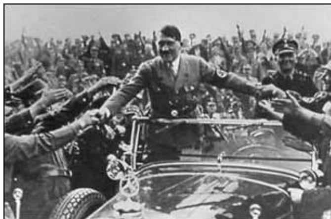
Hitler became dictator of Germany in March, 1933. Hitler was actually "elected" Chancellor in Jan. 1933, but it was the Reichstag fire that sealed the fate of freedom in Germany.

March 4 was the traditional Presidential inauguration Day from 1793 until 1933!!