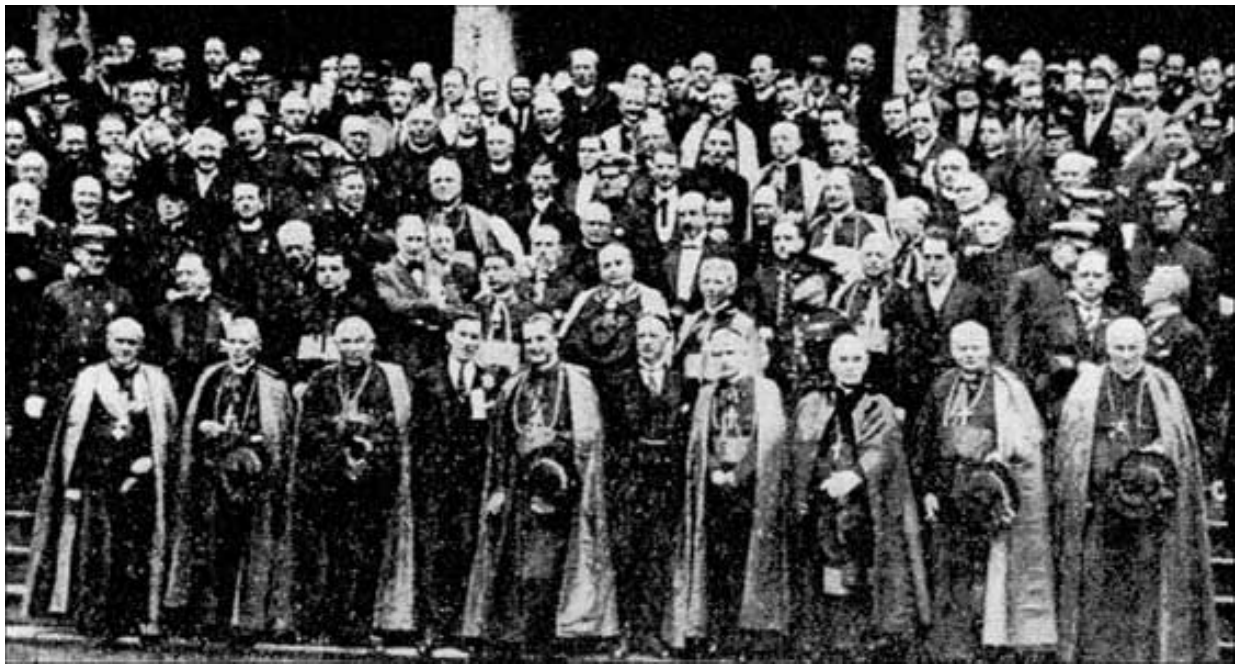
Smith and his fellow Cardinals on the steps of city hall in NYC in 1926. Al Smith is in the center.

Al was totally subservient to the hierarchy in Rome—had unlimited financing—and it was only 4 short months until the Presidential election.