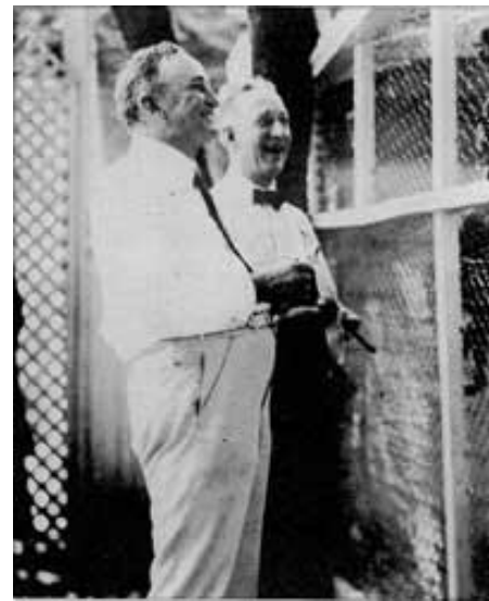
Al Smith and Joe Robinson, U.S. senator from Arkansas, his running mate in 1928.

Joe Robinson would later die from a heart attack while trying to help FDR pack the Supreme Court.