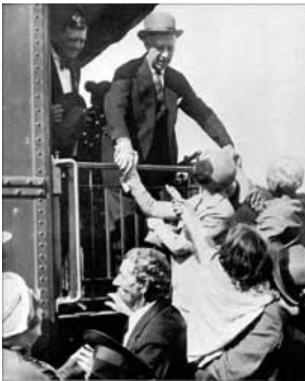
Al Smith campaigning for the Presidency from a train.

Al was totally subservient to the hierarchy in Rome—had unlimited financing—and it was only 4 short months until the Presidential election.