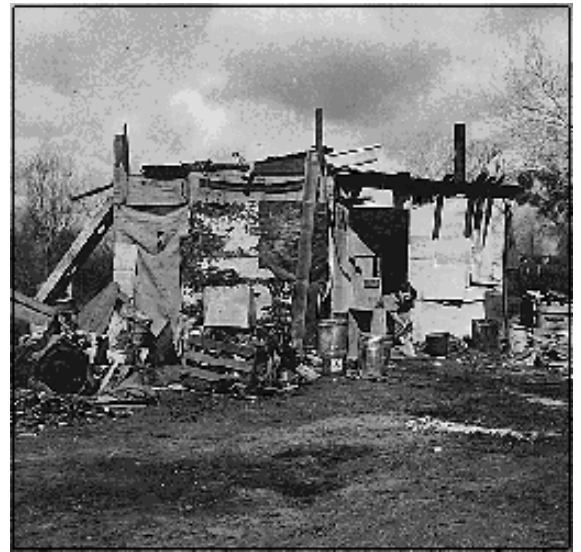
Squatters shack in California during the Great Depression.

The Wall Street stock market Crash of 1929 signaled the beginning of the Great Depression. Production fell sharply. Unemployment went through the roof. Only the very rich had any money so purchasing declined.