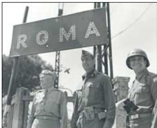
Soldiers of general Mark Clark occupy Rome in 1944.

Believe it or not the Pentagon actually invaded Italy in 1943.....This was during World War II and landings were made at Anzio and Salerno, with Rome finally occupied on June 4, 1944....BERLIN was supposed to be their main destination, but their map readers were a little confused, because Rome is about 700 miles (1180 kilometers) from Berlin over very mountainous terrain: