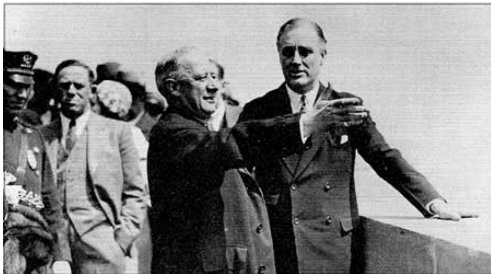
Smith with Roosevelt on the Observation Deck of the Empire State building during opening ceremonies in May 1931.