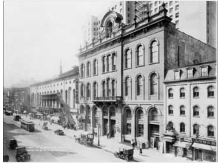
Tammany Hall in New York City was the home of the corrupt Smith political machine.

In June 1928, Smith was officially nominated for the Presidency by the Democratic party in Houston, Texas: