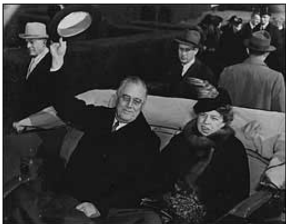
Roosevelt's inauguration on March 4 , 1933. He was the last President to be inaugurated on the Constitutional date of March 4.

The Great Depression, beginning in October 1929, caused the collapse of the world financial system. Millions of people throughout the world were thrown out of work and faced the prospect of starvation.... This "Federal" Reserve Bank engineered financial collapse gave Roosevelt the opportunity to usurp power in the U.S....and Hitler used the same crisis to become Führer in Germany.