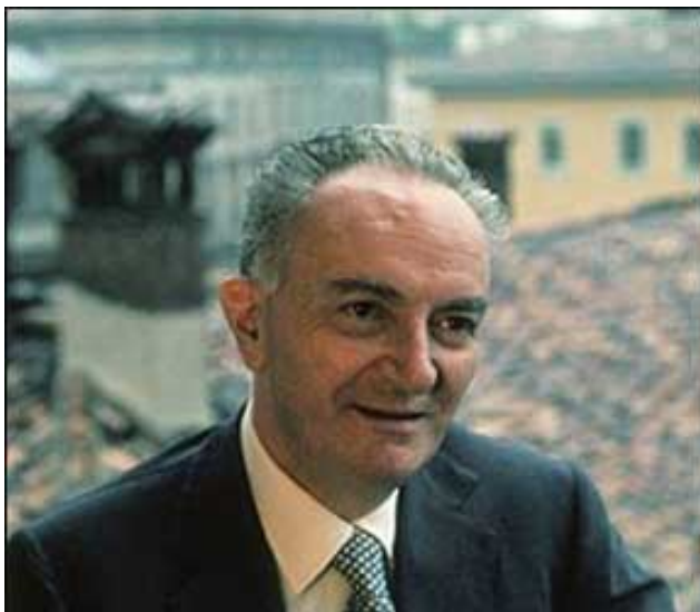
Michele Sindona (1920-1986) St. Peter's Banker.

The unification of Italy began in SICILY in 1860 when Garibaldi landed with his famous 1,000 red-shirted volunteers. The dis-unification of Italy began when the Pentagon controlled the Mediterranean after World War II. Once a precedent had been set, and Sicily had successfully seceded, the Pentagon expected that the other regions of Italy would follow suit, with the end result of the Papal States restored to the Pope.