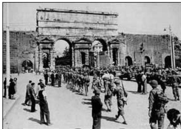
U.S. soldiers marching in Rome during the occupation.

Had Russia lost to Nazi Germany, this was a perfect opportunity to rearrange the map of Italy and restore the Pope to his former glory.