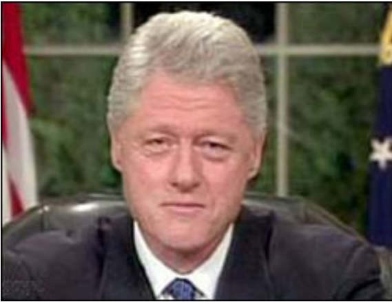
President Clinton a.k.a. President Rockefeller. President from Jan. '93 to Jan. 2001.

President Clinton—the Borgia of the backwoods—came from the state of Arkansas, one of the poorest states in the Union with only 6 electoral votes....In real life that just does not happen unless he had BLOOD TIES to the Mafia family who OWN the government of the United States!!