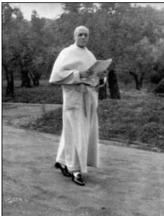
Pope Pius XII taking a daily stroll weeks before his death.