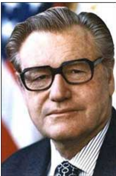
Nelson Rockefeller (1908-1979). Vice President from 1974 to 1977.

The success of the ecumenical movement in the U.S. necessitated getting a Vatican and Pentagon puppet into the White House because the President still has the final say when it comes to launching nuclear weapons. The friendly overtures of the ecumenical movement did not extend to Russia and her allies and they still remained the FINAL TARGET for a nuclear attack by the Pentagon.