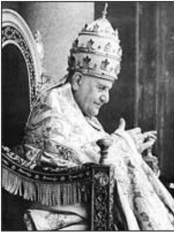
"Good" Pope John XXIII. (Pope from 1958 to 1963).

After the timely death of Pope Pius XII, Jesuit general Janssens —also known as the Black Pope —ordered a complete change of tactics. He had Angelo Roncalli "elected" White Pope and he called Vatican Council II or the ecumenical movement.