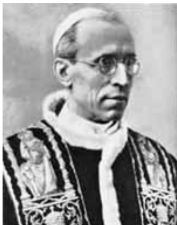
Eugenio Pacelli (1876-1958). White Pope from 1939 to 1958.

Pope Pius XII was a fanatical Fatima Crusader and a bitter enemy of Russia.