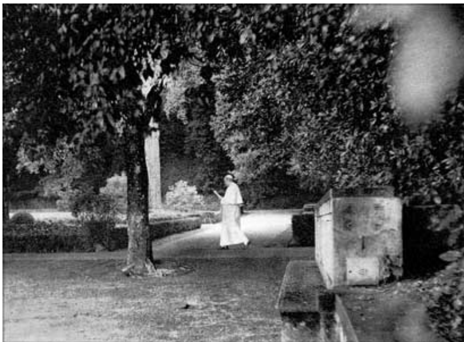
These photos were taken by Dr. Galeazzi-Lisi just days before the timely demise of his patient.

Black Pope Janssens ordered a change in tactics called Vatican Council II