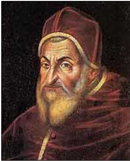
Pope Sixtus V (1521-1590). White Pope from 1585 to 1590.

"When the news of the Armada's failure arrived in Rome, there was posted up a pasquillade, in which Sixtus was made to offer, out of the plenitude of his power, a thousand years' indulgence to anyone who would give him information respecting the whereabouts of the Spanish fleet: whether it had been taken up into heaven, or had descended into hell; whether it was hanging in mid air, or was still tossing on the ocean." (Wylie, History of Protestantism , vol. II, p. 460).