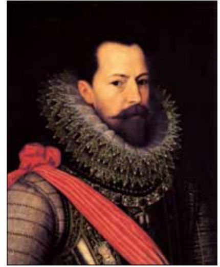
The Duke of Parma (1545-1592), led the invasion force in the Netherlands.

My brother Don Juan To England has gone To kill the Drake And the Queen to take And the heretics all to destroy