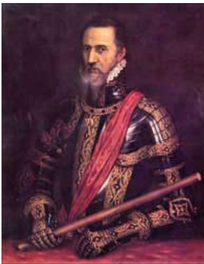
Duke of Alva (1507-1582).

Throughout Europe, the Spanish army was notorious for their ferocity and ruthlessness. It had taken them over 700 years to drive the Moors from Spain . . . and suddenly they were the most feared army in the world!!