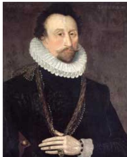
Sir John Hawkins (1532-1595).