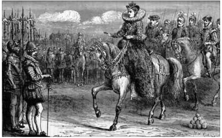
Queen Elizabeth addressing her troops at Tilbury.

During Elizabeth's reign, the Reformation was firmly established in her kingdom, and Philip II was determined to stamp it out no matter what the cost.