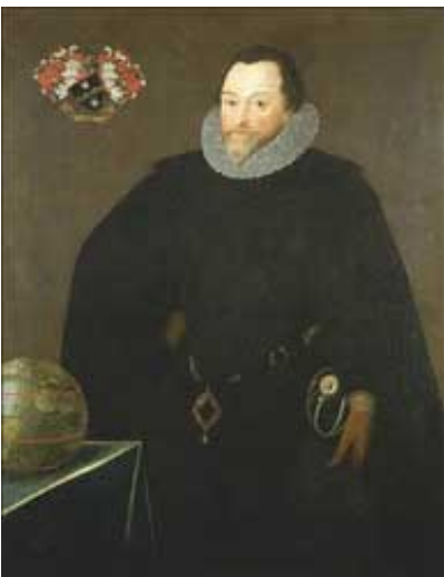
Sir Francis Drake (1540-1596).

The much smaller English ships were commanded by brave sea captains like Admiral Sir John Hawkins, Lord Thomas Howard, Sir Martin Frobisher and Sir Francis Drake.