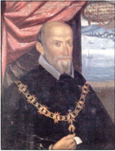
The Duke of Medina Sidonia (1550-1615), led the "Invincible" Armada.