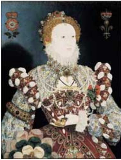
Elizabeth I (1533-1603). Queen from 1558 to 1603.