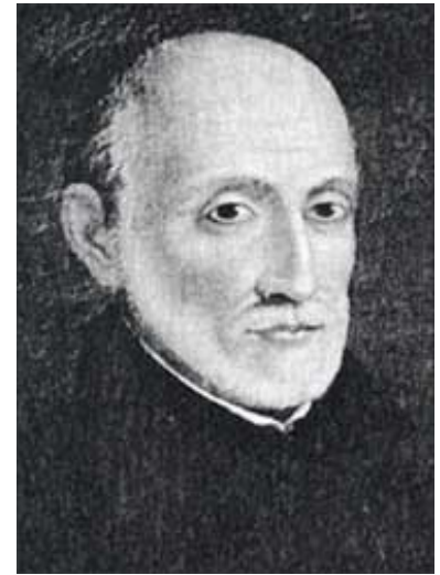
Jesuit general Claudius Aquaviva. Black Pope from 1581 to 1615.

Being Pope at that time was more dangerous than sailing with the Armada!!