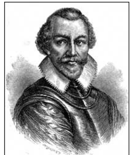
Sir Martin Frobisher (1535-1594).