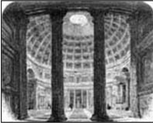
The Pantheon at Rome.

Luther made a visit to the unholy city in 1510. While climbing Pilate's staircase on his knees to do penance for his sins he heard a voice like thunder say: