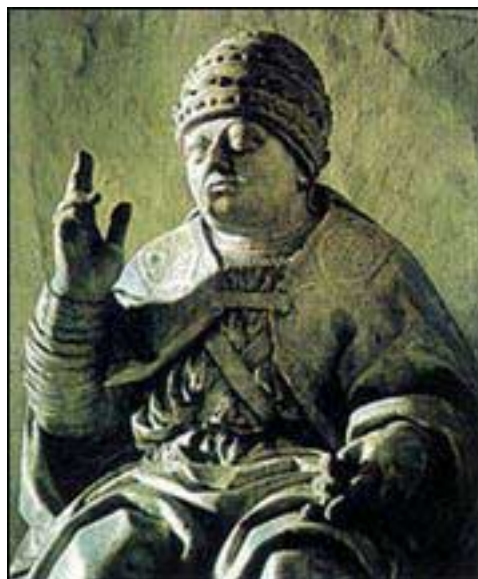
Pope Leo X. (1513 - 1521).

Leo thundered at Saint Martin and ordered him to appear at Rome with 60 days!!