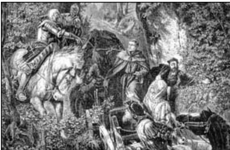
Luther carried off to the Wartburg.

Luther was put under the Ban of the Empire. His friends, fearing for his safety, kidnapped him and carried him off to the Wartburg Castle.