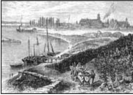
City of Worms.

Site of the famous Diet of Worms held in 1521. Here Luther defended his writings before the Emperor Charles and all the dignitaries of the empire. Here he made his timeless reply when asked if he would recant his writings: