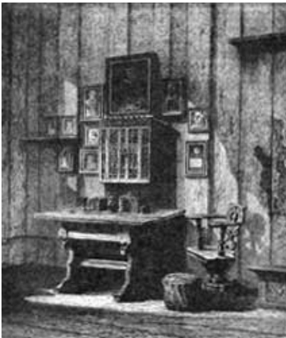
Saint Martin's study about 1850. On the right can be seen the ink stain and the broken plaster on the wall.

Dreadful noises in his chamber at night would awaken him from sleep. Howling as of a dog could be heard at his door, and on one occasion as he sat translating the New Testament, an apparition of the Evil One, in the form of a lion, seemed to be walking round and round him, and preparing to spring upon him. Seizing the weapon that came first to his hand, which happened to be his inkstand, Luther hurled it at the devil with such force, that he put the fiend to flight, and broke the plaster on the wall.