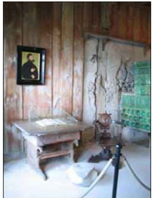
Recent photo of Saint Martin's study. Much of the plaster has been removed by souvenir hunters.