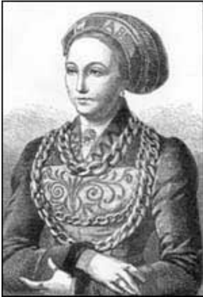
Luther's wife ex-nun Saint Katharina von Bora as a bride.

Saint Martin was very reluctant to marry because of his precarious existence as an outlaw under the Ban of the Empire. Any day he expected to be arrested and burned alive.