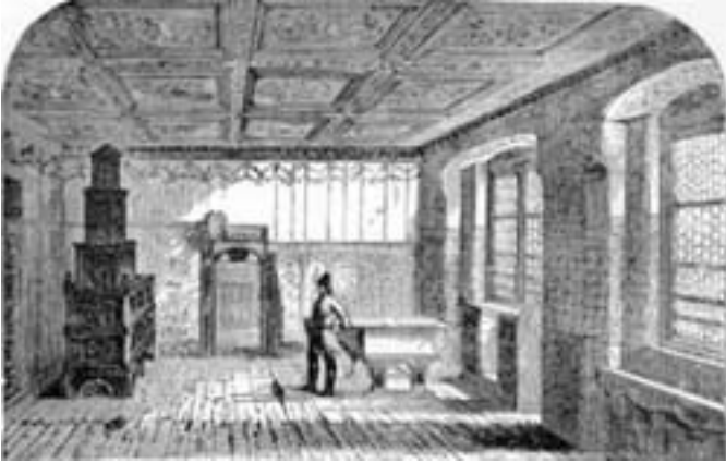
Luther's study at Wittenberg

The German translation of the Holy Scriptures was the best and most accurate translation since the Latin Italic version of 150 A.D. All the other version are copies of that masterpiece.