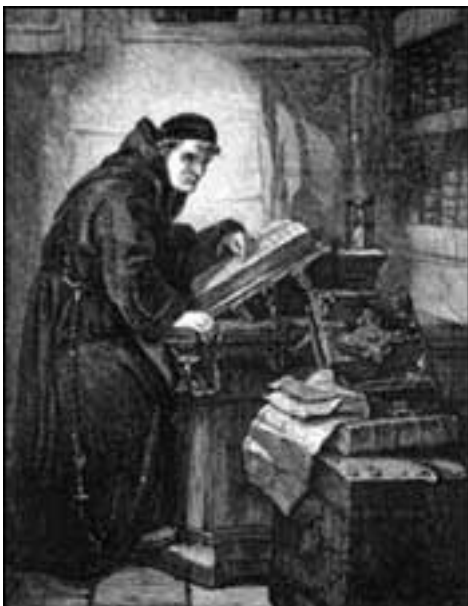
Luther's discovery of the

Luther had a near miss with lightning and almost got killed. That is why he decided to become a monk. By forsaking the world and hiding himself in a monastery, the monk believed that he was serving God. He soon learned that the thick walls do not keep out the lusts which burn within.