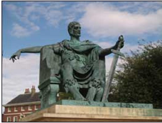
Statue of Constantine in York, England.

Emperor Constantine divided the Roman Empire into 2 halves when he founded a new capital in the East called Constantinople.