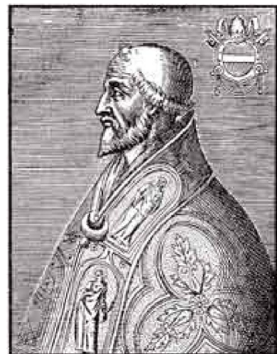
Pope Leo IX (Pope from 1049 - 1054).

From then on, the East called themselves Orthodox , while the West or Latins called themselves Catholics .