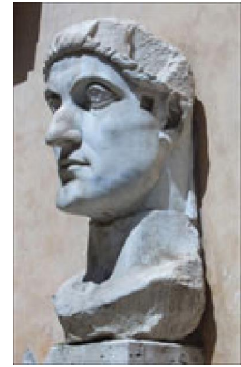
Colossal head of Constantine in Rome.

The Western LEG of this divided Empire became known as the Latin Papacy , and around 1000 A.D., arrogated the name CATHOLIC or universal.