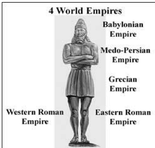
4 world empires of Daniel chapter 2.

These 2 churches represent the 2 LEGS of the metal image seen in the dream of King Nebuchadnezzar of Babylon.