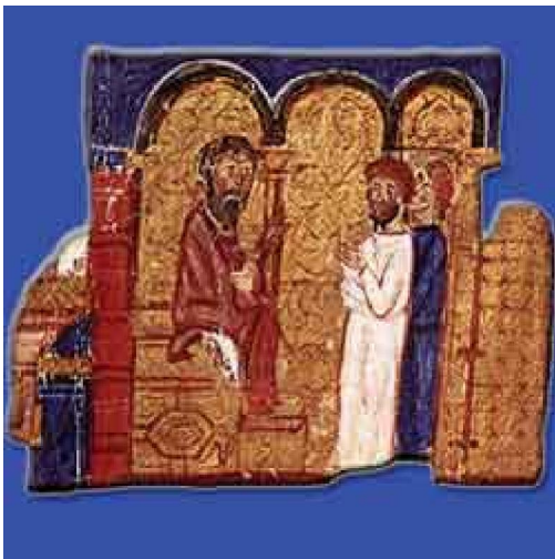
Michael Cerularius (Patriarch from 1043 to 1059).

This addition to the 7 ecumenical councils by the Latin church led to the final separation in 1054.