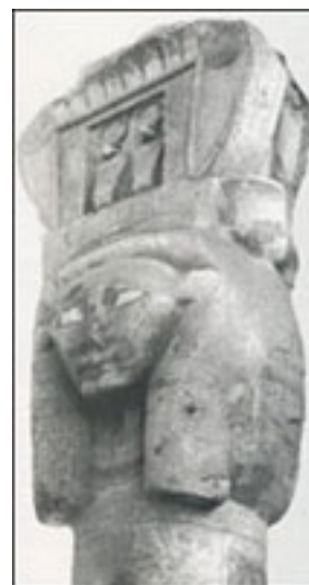
A sistrum shaped column at the shrine of Hathor at Deir el-Bahri. Notice the cow's ears and the 2 cobras on top.