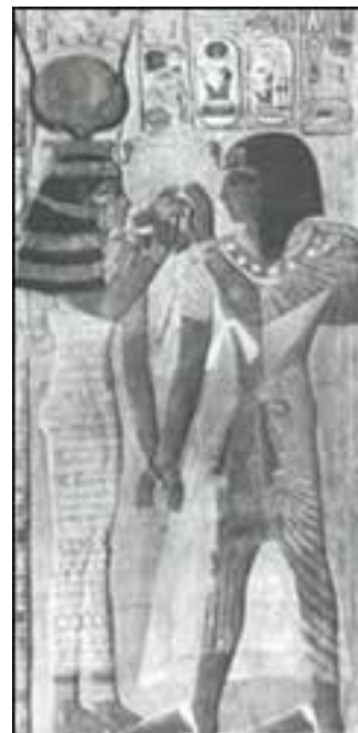
Pharaoh touches the menit-necklace of Hathor or Isis symbolizing the fact that ALL his power came from this serpent goddess!!