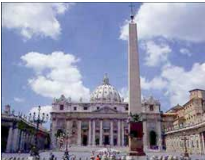
Egyptian obelisk at the Vatican.

This obelisk once stood in front of the temple of Isis in Heliopolis, Egypt, and was brought to Rome by the Emperor Caligula in 47 A.D. It was moved to its present location in 1586. Heliopolis is the Greek name for Bethshemesh which was the headquarters of Egyptian sun worship in Old Testament times.