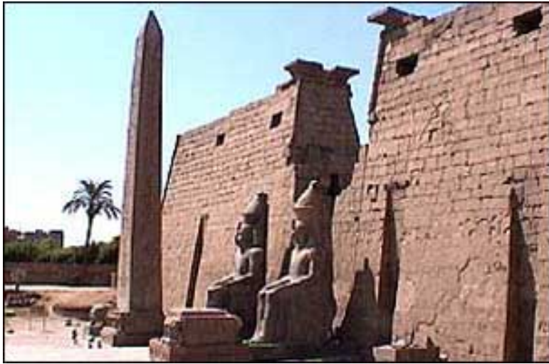
Obelisk of Rameses II, built by Hebrew slaves.

"Therefore they did set over them taskmasters to afflict them with their burdens." (Exodus 1:11).