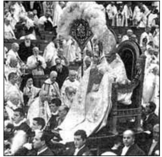
Pope Paul VI carried in a procession.

The Vatican system is such an EXACT COPY of the ancient Egyptian religion system that it is surprising that the Egyptian government does not sue the Vatican for copyright infringement.