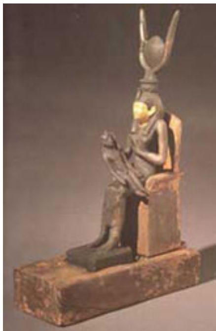
Isis the Mother, Horus the Child.