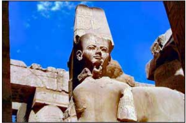
Giant statue of Pharaoh Rameses at temple of Karnak in Luxor, Egypt.

Satan, working through Pharaoh, inaugurated a gigantic building program: