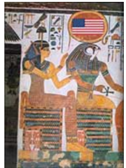
The United States of Egypt!!

This is not a fit symbol to honor the father of our country who refused to be a dictator . . . or a king!!