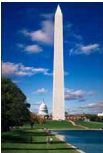
The sinister looking obelisk dominates the

Rome, Rockefeller and Roosevelt turned the United States of Cabotia into the United States of Egypt!!