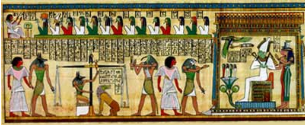
The Scales of Anubis at the Judgment Seat of Osiris.

However, Pharaoh hardened his heart again and pursued after Israel. Moses had apparently blundered and led his people into a trap. Pharaoh pursued the Israelites and was overthrown at the Red Sea. . . . Pharaoh was so completely possessed by Satan that he did not care if his entire army and country was destroyed -- as long as he could defeat God's purpose.