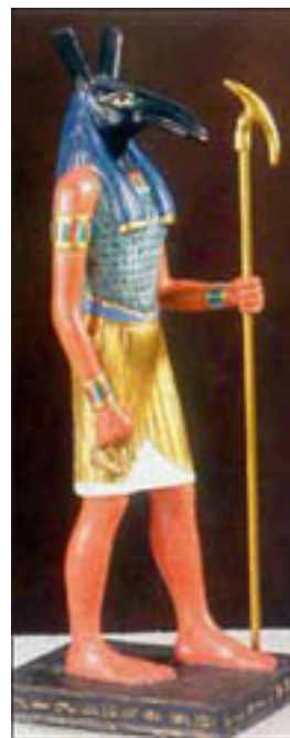
The Egyptian god Seth.

IHS also stands for IN HOC SIGNO VINCES or IN THIS SIGN CONQUER. It was first used by Emperor Constantine when he changed the Roman eagle for the CROSS.