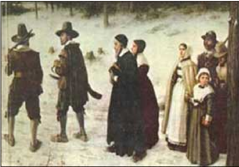
Pilgrim Fathers— Founders of the United States of Cabotia.

In 1620, the Pilgrim Fathers landed at Plymouth Rock, Massachusetts. They were Protestant Christians sent out by that great Scot -- King James VI & I . They were the CHOSEN PEOPLE and God gave them the best land in the world as a heritage because they came to seek GOD . . . not GOLD.