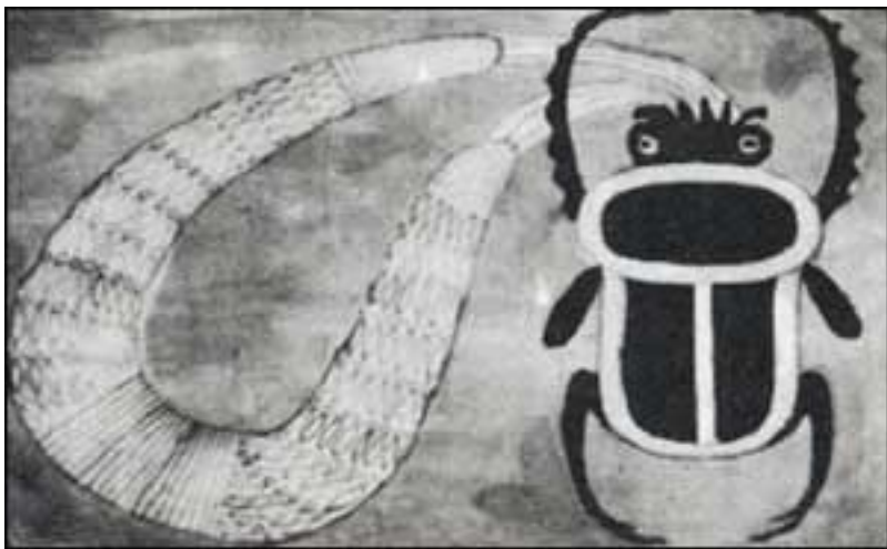
A menit-necklace combined with a scarab beetle symbolizing Hathor's erotic power connected with the rising sun god. This necklace was an amulet or magic charm worn by Hathor or Isis.