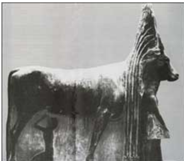
Life-size statue of the holy cow from the Temple of Hathor at Dendara.