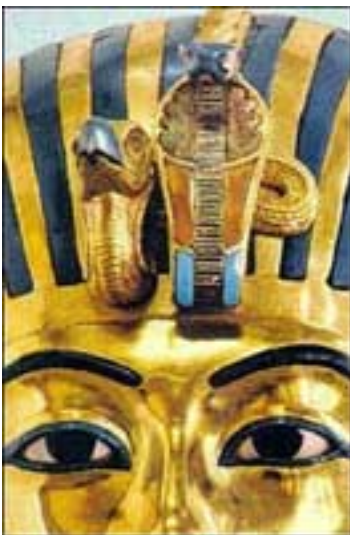
Pharaoh with vulture and serpent on his forehead!

This Egyptian dynasty that Satan raised up was the culmination of all his cruelty, cunning, subtly, deception etc., etc. In the Old Testament period, Satan had a death grip on the world, and did not need any disguise. When the serpent tempted Adam and Eve and caused the fall of the human race, God cursed the serpent and told him that he would CRAWL on his belly all the days of his life. Here we see Satan exalting himself and arrogantly displaying himself on the FOREHEAD of Pharaoh.