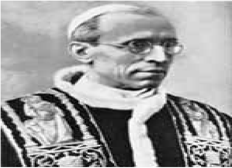
Pope Pius XII carried in a procession.