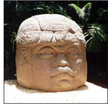
Giant head found at an Olmec site in La Venta.

As the first people in that area, their lineage goes back to Noah, and the dispersal of the nations at the Tower of Babel.