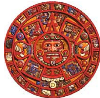
Mayan round calendar.

The 260 and 365 day calendars synchronized every 52 years.