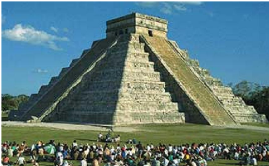
Chickén Itzá pyramid, Yucatán Peninsula, Mexico.

For in as many days as this world was made, in so many thousand years shall it be concluded. And for this reason the Scripture says: Thus the heaven and the earth were finished, and all their adornment. And God brought to a conclusion upon the sixth day the works that He had made; and God rested upon the seventh day from all His works, Genesis 2:2. This is an account of the things formerly created, as also it is a prophecy of what is to come. For the day of the Lord is as a thousand years; 2 Peter 3:8 and in six days created things were completed: it is evident, therefore, that they will come to an end at the sixth thousand year. (Saint Irenaeus, Against Heresies , Book V, ch. 28).