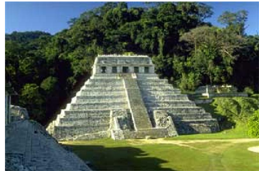
Pyramid of Pacal Votan, Palenque, Mexico.

Mayan pyramids were astronomical observatories and were actually calendars to faithfully record the passage of time.