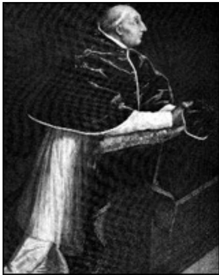
Pope Martin V (1368-1431).

borrower being at any time entitled to pay off the debt, while the lender renounced the right to call it in. These arrangements were especially common in Germany, where they acquired the name of contractus Germanici . They were plainly usurious according to all the definitions of usury, but, when, about 1425, some nobles of Silesia endeavored to repudiate their obligations on that score, the clergy of Breslau appealed to Pope Martin V, representing that such contracts had been customary for a time beyond the memory of man, and that the funds of the churches and canonries were largely invested in them: more than two thousand altars being thus employed. Pope Martin lent a favourable ear to the appeal and pronounced such contracts lawful and liable to enforcement if contested. In 1455 a similar appeal from the Bishop of Merseburg came to Calixtus III, and met the same favourable response" (H. C. Lea, Ecclesiastical Treatment of Usury ).