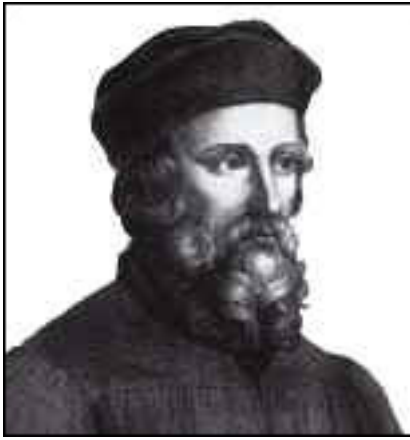
John Huss (1380-1415).

John Huss, a Catholic priest and professor at the university of Prague was burned at the stake for preaching the Gospel of Christ.