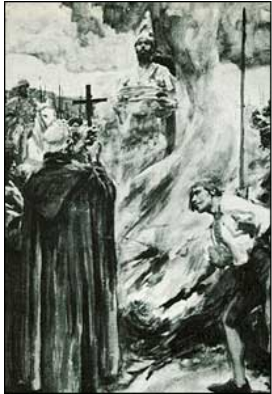
Burning of John Huss on July 6, 1415.

John Huss, a Catholic priest and professor at the university of Prague was burned at the stake for preaching the Gospel of Christ.