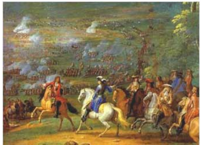
Battle of Rocroi in 1643 in which French forces soundly defeated the imperialists.

The French won many victories, and finally the war was ended with the Peace of Westphalia in 1648.