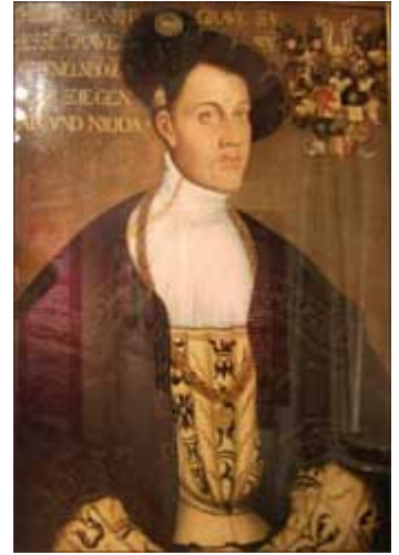
Philip I Langrave of Hesse (1504-1567).

Philip of Hesse (known as Philip the magnanimous) was the driving force behind the acceptance of the Reformation in Germany.