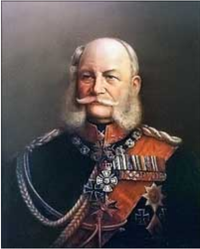
German Emperor William I (1797-1888). Reigned from 1861 to 1888.

The Franco-Prussian War or Franco-German War, often referred to in France as the 1870 War (July 19, 1870-May 10, 1871), was a conflict between France and Prussia, which was backed by the North German Confederation and the south German states of Baden, Württemberg and Bavaria.