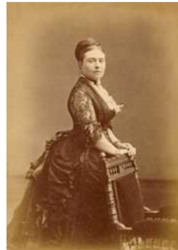
Princess Victoria (1840-1901). Wife of Emperor Frederick III.

His son, William II, succeeded him and he was the notorious Kaiser of WWI.