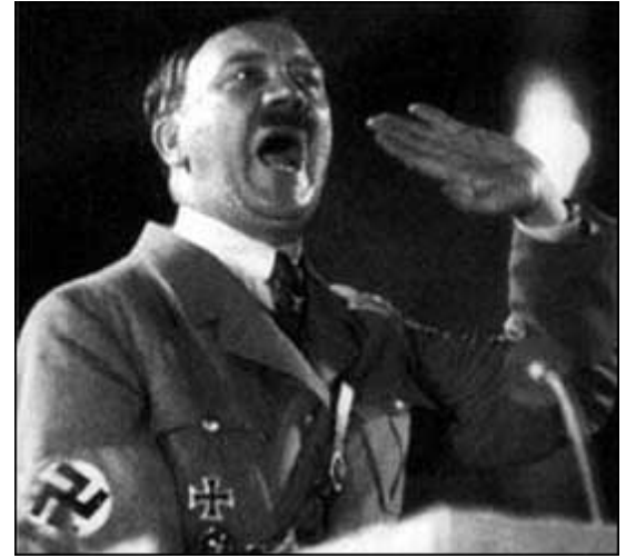
Adolf Hitler (1889-1945).