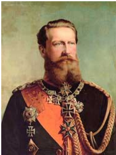
Kaiser Frederick III (1831-1888). Reigned only 99 days.

Emperor Frederick III was married to the eldest daughter of Queen Victoria, thus cementing an alliance of peace and friendship between Great Britain and the German Empire.