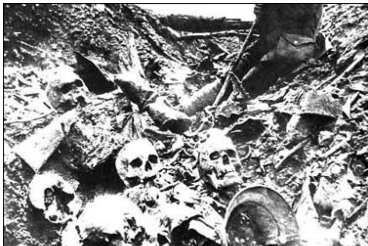
Massive German casualties at the battle of Verdun. Europe had not seen such a bloody conflict since the 30 Years' War.

The war turned out to be a disaster for the Kaiser and he abdicated on November 9, 1918.