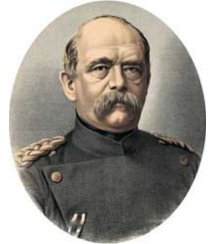
Otto von Bismarck (1815-1898). Chancellor of Germany from 1871 to 1890.

In order to defend Paris, the French soldiers had to be withdrawn from Rome, and the Italian patriots rushed in, and declared the city their capitol after a long wait of over 1,000 years.