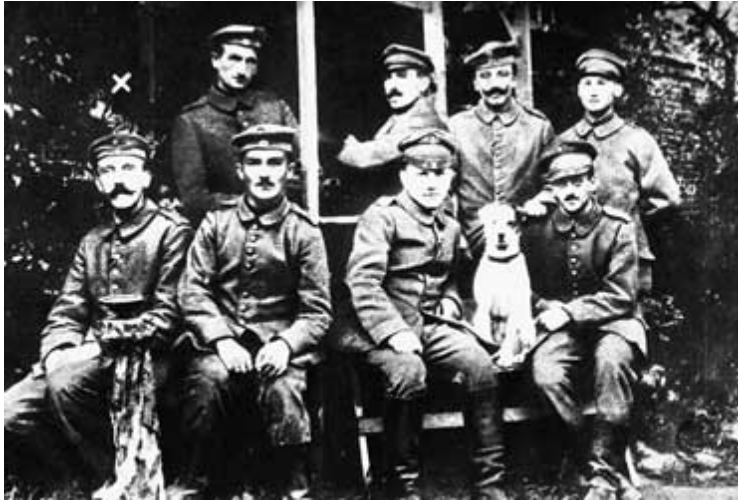
Hitler can be seen on the left with his fellow soldiers.

Hitler, as a soldier in the defeated army, was very bitter and a pliable tool in the hands of the Jesuits.