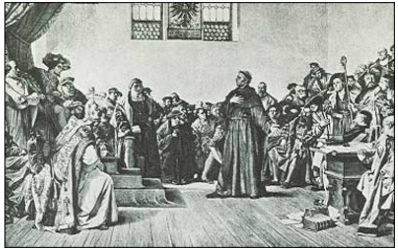
Saint Martin Luther defends his writings before the Emperor Charles V at the Diet of Worms.

In 1521, disguised as a knight, Saint Martin began working on his incomparable translation of the New Testament from Greek into German. The devil was furious and full of hellish rage. This is where the famous incident of throwing ink at the devil took place.