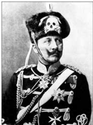
Kaiser William II (1859-1941). Reigned from 1888 to 1918.

He dreamed of repeating the lightning Prussian victory of 1870 over France, but this time his hopes were disappointed, because the plans of the Jesuits are always doomed to failure.