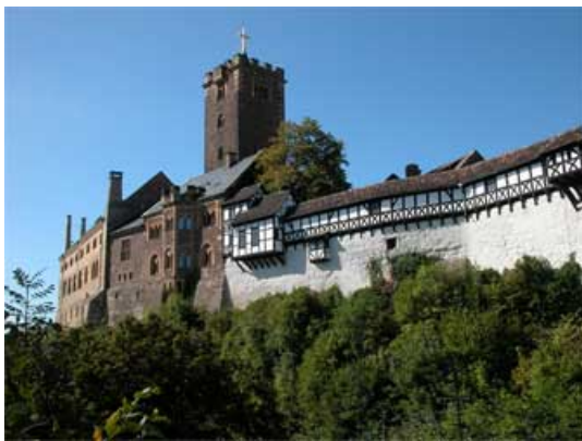
Wartburg Castle where Saint Martin worked on his Greek to German translation of the New Testament.

Dreadful noises in his chamber at night would awaken him from sleep. Howling as of a dog could be heard at his door, and on one occasion, as he sat translating the New Testament, an apparition of the Evil One, in the form of a lion, seemed to be walking round and round him, and preparing to spring upon him. Seizing the weapon that came first to his hand, which happened to be his inkstand, Luther hurled it at the devil with such force, that he put the fiend to flight, and broke the plaster on the wall.