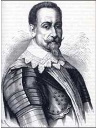
King Gustavus of Sweden (1594 -1632). Reigned from 1611 to 1632.

raised up a champion to save the Christians from complete extinction. His name: King Gustavus of Sweden—the Lion of the North .