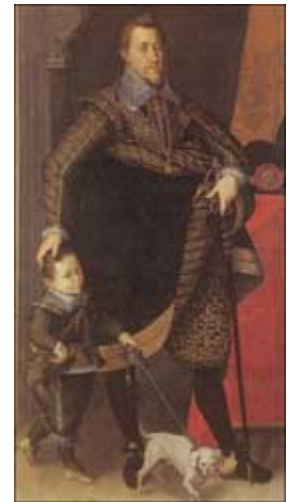
Emperor Ferdinand II (1578-1637). Reigned from 1619 to 1637.

The terrible conflict was mostly confined to Germany, but most countries sent mercenaries to fight on either side.