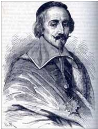
Cardinal Richelieu (1585-1642). Prime Minister from 1624 to 1642.

Of course the Jesuit general was delighted with the death of the king of Sweden. His rejoicing was turned into mourning however when the French entered the conflict. The imperialists were deemed invincible but the victories of King Gustavus encouraged the French to help the Swedes.