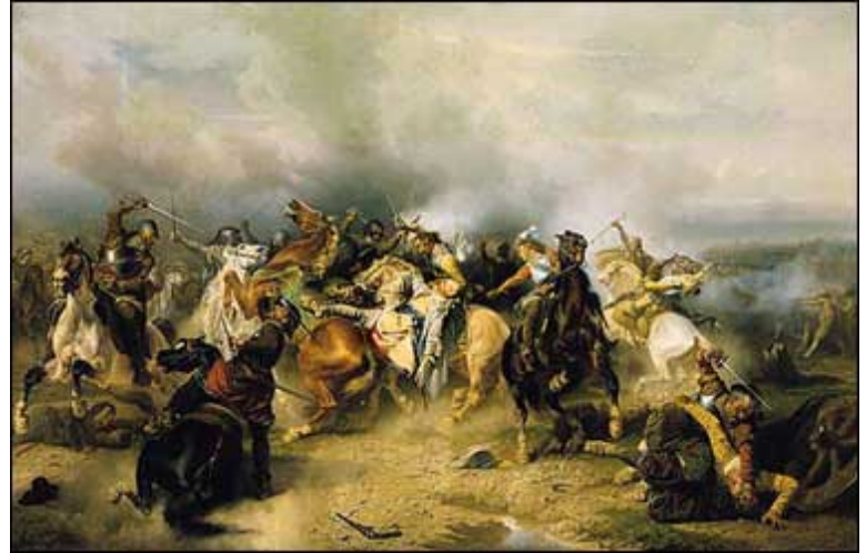
Death of King Gustavus at the Battle of Lutzen in 1632.

Determined to march to Austria and depose Ferdinand II, he was killed at the Battle of Lutzen in 1632.