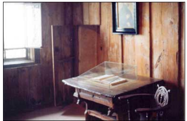
This is the room where Saint Martin translated the New Testament into German.

After his excommunication by Pope Leo X and his refusal to recant at the Diet of Worms, Saint Martin was taken to this castle for safety at the request of Frederick the Wise.