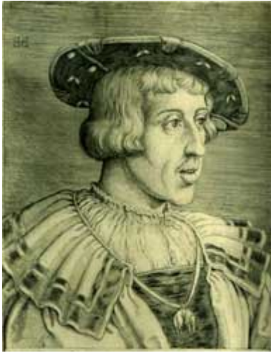
Archduke Ferdinand (1503-1567).

So quickly did the Truth spread that in 1526, the Reformed Christians had a meeting with the archduke Ferdinand (brother of Emperor Charles V) to remove the excommunication and ban on Luther and give official recognition to the Reformation.