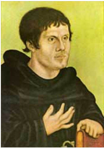
Saint Martin Luther (Nov. 10, 1483- Feb. 18, 1546).

The trend of human nature is always to become more corrupt unless Reformers stem the tide of evil.... Many tried to reform Christianity before Luther, but their attempts were drowned in blood. By the 6th century, Hibernian missionaries found Christianity in Europe to have totally departed from the Apostolic Faith.