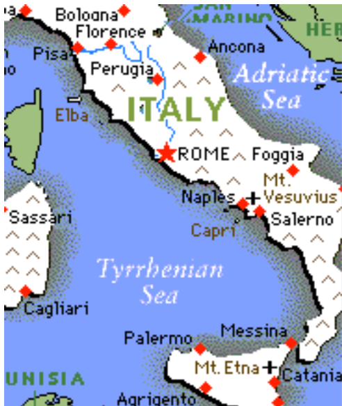
Map of Italy after the fall of the Papal States.

1870 Joins republican France in the Franco-Prussian war, and is made commander of an army in the Vosges....This is one of the most important years in history. After 1260 years, Rome ceases to be governed by the Popes and becomes the Capital of the new united Italy. Pius IX declares himself infallible in the same year!!