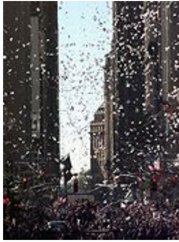
Ticker tape parade on Broadway.

Garibaldi was offered a ticker tape parade up the "canyon of heroes" in New York City. The Jesuits stirred up the Irish Catholics against him and in order to keep the peace he refused the offer. Of all the many world famous personalities to have been offered this singular honor, Garibaldi remains the only person to date to have refused it!!