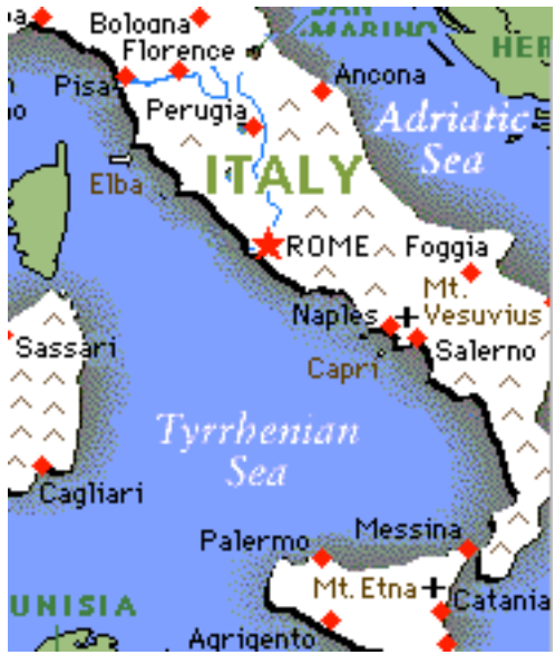
Map of Italy after the fall of the Papal States.

1870 Joins republican France in the Franco-Prussian war, and is made commander of an army in the Vosges....This is one of the most important years in history. After 1260 years, Rome ceases to be governed by the Popes and becomes the Capital of the new united Italy. Pius IX declares himself infallible in the same year!!