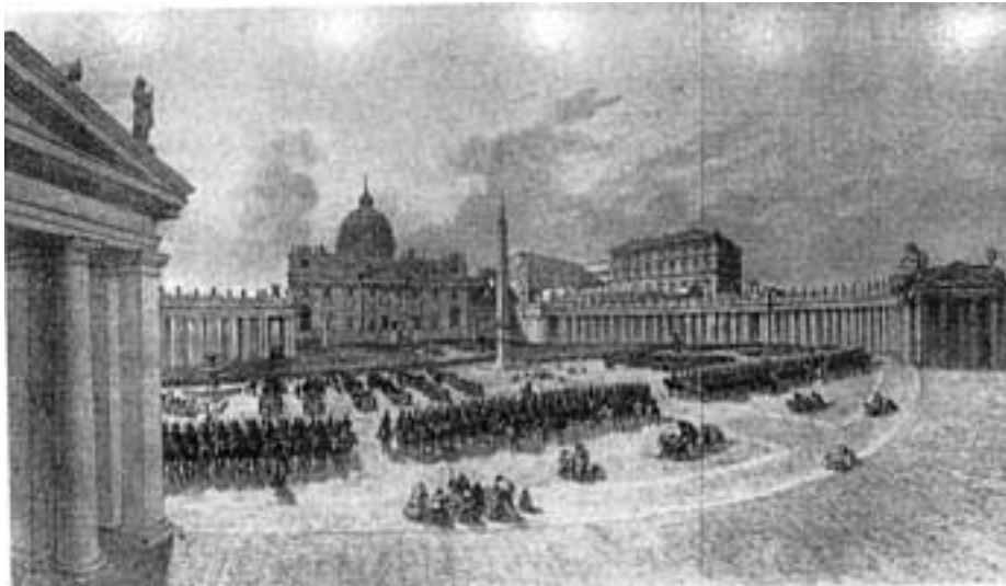
Pope blesses the victorious French Army at the Vatican.

Pope Pius IX was the longest reigning Pope in history and the great antagonist of Italian unity. During his reign the firing squads and the scaffolds were kept busy day and night. He urged the Austrians to set up the guillotine and he would not allow railroads to be built in the Papal States!