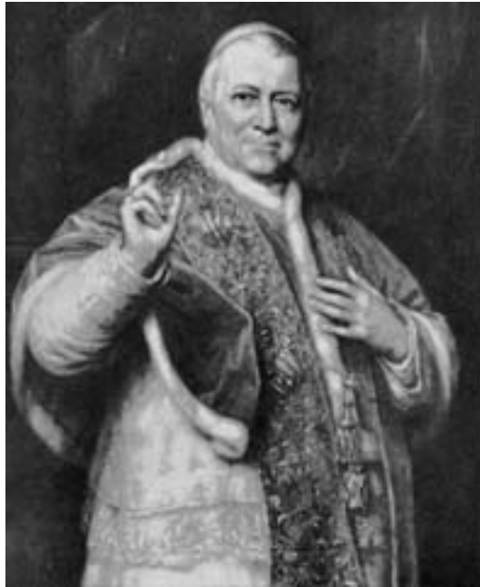
Pope Pius IX (1846-1878).