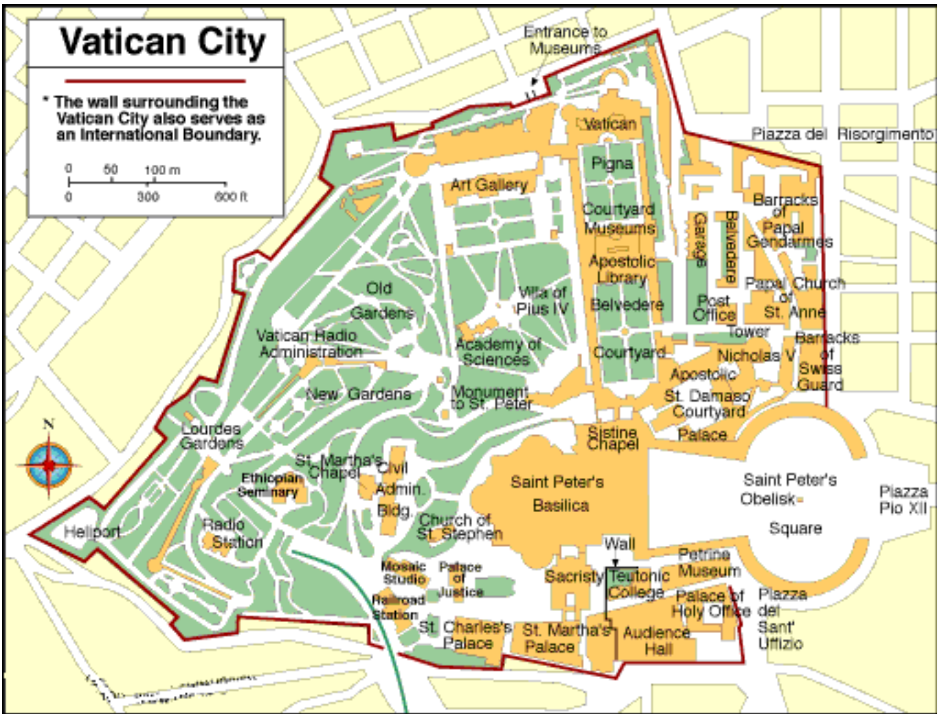
Vatican City State.

Thanks to Benito Mussolini, the beast that was slain came to life again. From that time onwards most of the nations of the world started to recognize the Vatican and send Ambassadors to its headquarters including the U.S. in 1984: