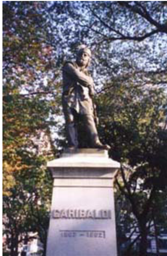
Garibaldi Monument in New York City.

Garibaldi statue in Washington Sq. Park, downtown New York City. Make it destination #1 when you visit the Big Apple.