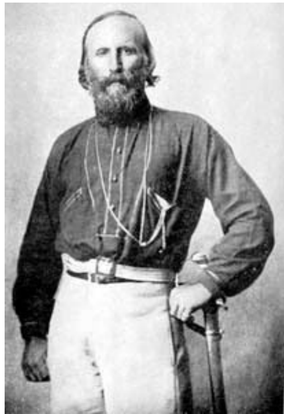
The Papal States divided Italy for about 1260 years (606 -1866).