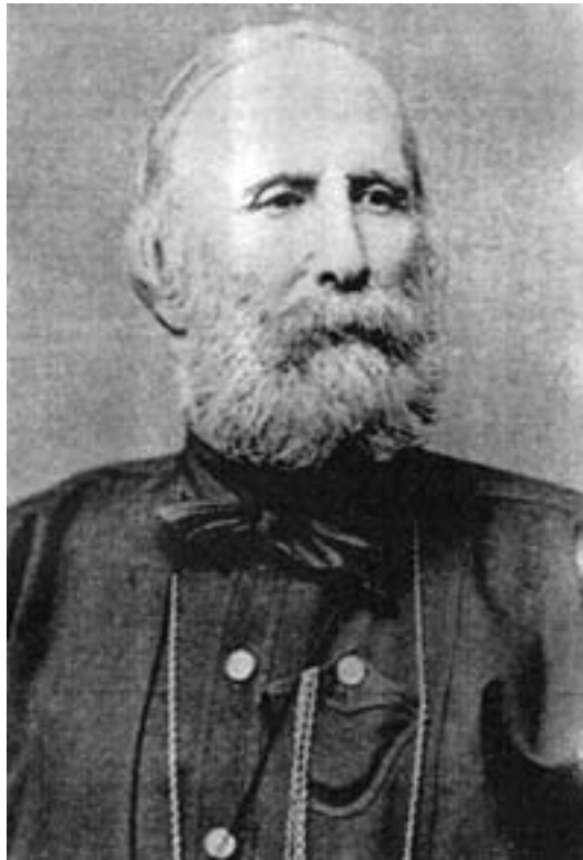
Garibaldi in his golden years.

(June 2) Dies and goes to his eternal reward in Heaven.