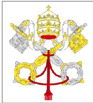
Keys of St. Peter.