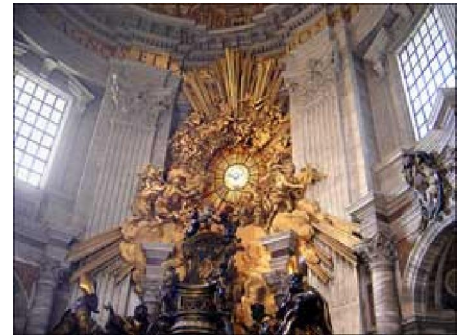
St. Peter's Chair.