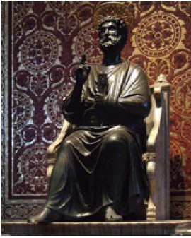
Statue of St. Peter in St. Peter's Basilica.