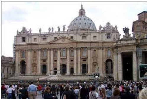
St. Peter's Square and Basilica.

Thus in Old Rome we have St. Peter's Square and Basilica; with the chair of St. Peter and statues of the Saint all over Vatican City.