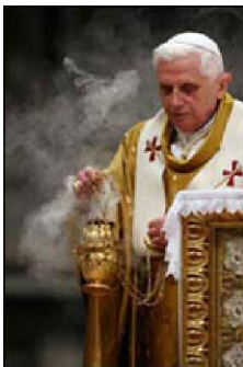
Pope Benedict XVI.

Pope is a GREEK word meaning FATHER....According to the Council of Chalcedon, these 2 men share equal authority and jurisdiction over their followers.