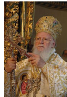
Patriarch Bartholomew I.

According to the Council of Chalcedon, these 2 men share equal jurisdiction over their respective followers in the East and West.