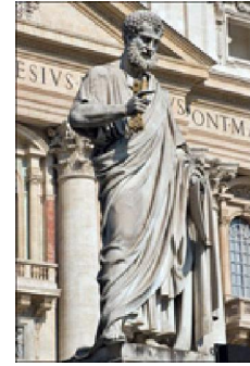
Statue of St. Peter in Vatican City Square.

With all the statues and paintings of St. Peter in Rome, it does seem convincing "proof" that St. Peter was actually in Rome except for 1 little FACT—the Greeks never heard a word about it.