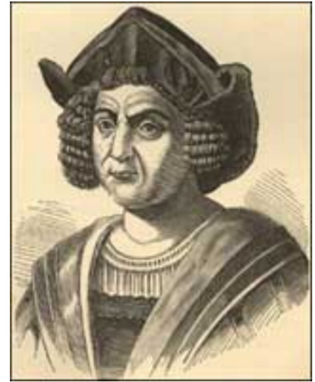
Columbus from De Bry's America

No portrait of Columbus exists...No artist or sculptor considered the great "Admiral" and "Discoverer" of the New World a fit subject for a portrait.