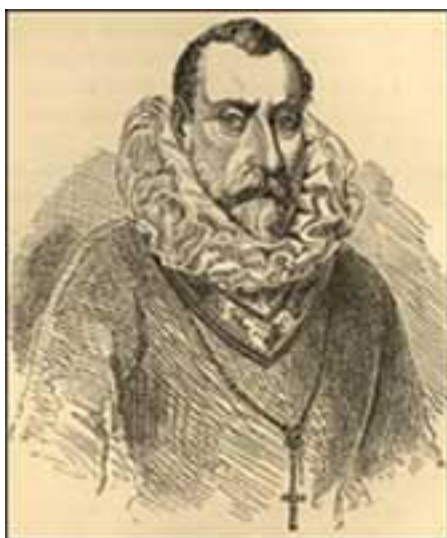
Columbus from a picture in the Bibliothèque Impériale, Paris.