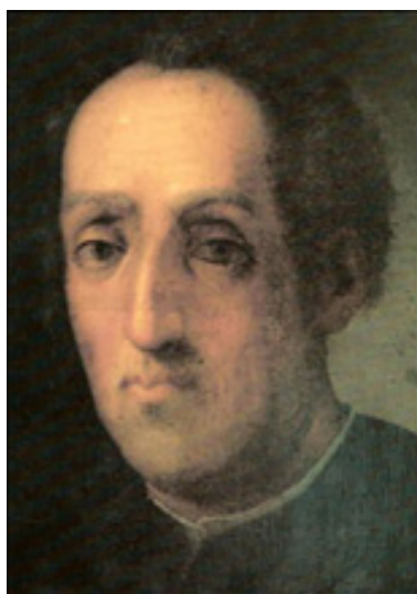
Columbus from the Biblioteca Nacional, Madrid.