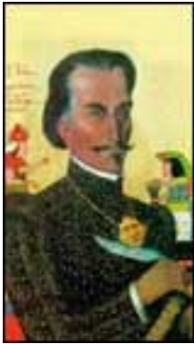
Garcilaso de la Vega, El Inca.

" ...And because of the delay they ran out of water and supplies. For this reason and because of the great privations they had suffered on both journeys, they began to sicken and die, and of seventeen men who left Spain, no more than five reached Terceira, among them the pilot Alonso Sanchez de Huelva. They stayed at the house of the famous Genovese Christopher Columbus, because they knew he was a great pilot and cosmographer and made seamen's charts. He received them kindly and entertained them lavishly so as to learn the things that had happened on the long and strange voyage they said they had undergone. But they arrived so enfeebled by hardships that Christopher Columbus could not restore them to health despite his attentions, and they all died in his house, leaving him the heir to the hardships that had caused their death" ( Royal Commentaries of the Incas, vol. 1, pp. 12-14 ).