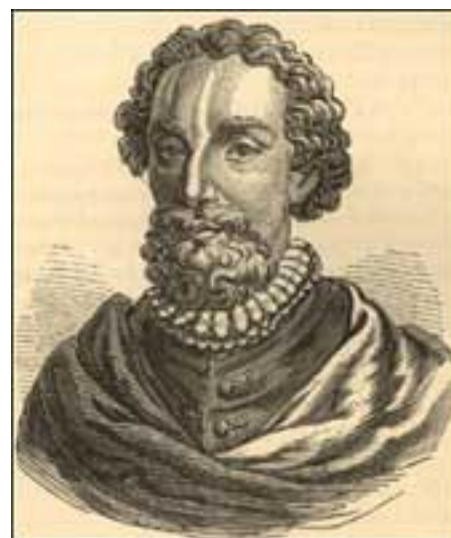
Columbus from Herrera's West Indies .