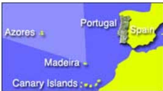
Island of Madeira where Columbus lived.

In 1486, 5 shipwrecked Spanish sailors died in the house of Columbus after returning from a voyage to the West Indies!!