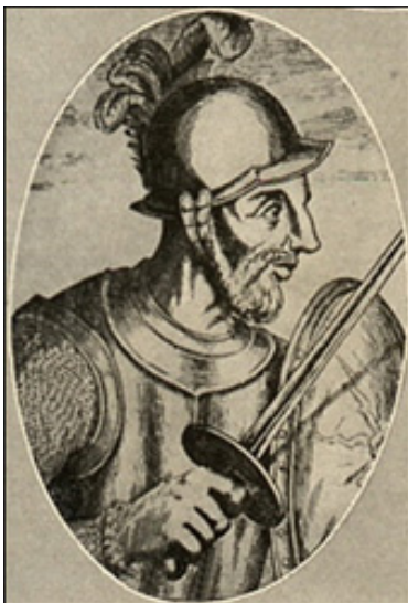
Alonso de Hojeda (1468-1515).

Alonso de Hojeda was licensed to kill by Ferdinand and Isabella!!