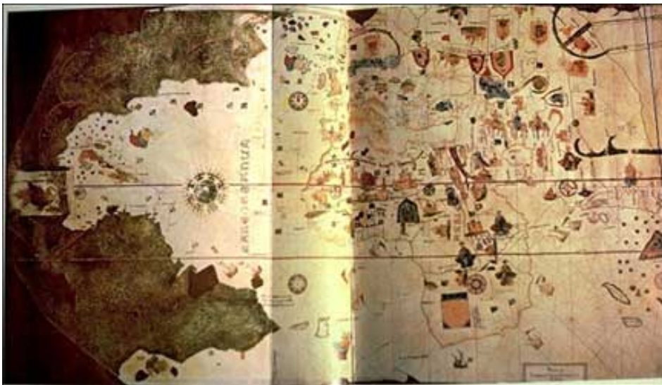
The Juan de la Cosa map.

Only John Cabot had charted the New World coastline up to that time. Here is the oldest map of the New World showing English flags all the way from Newfoundland to Florida. For 3 centuries it lay in the secret archives of the Vatican until it was carried to Paris by Napoleon Bonaparte in 1810.