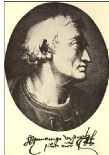
Portrait and signature of Vespucci, 1508.