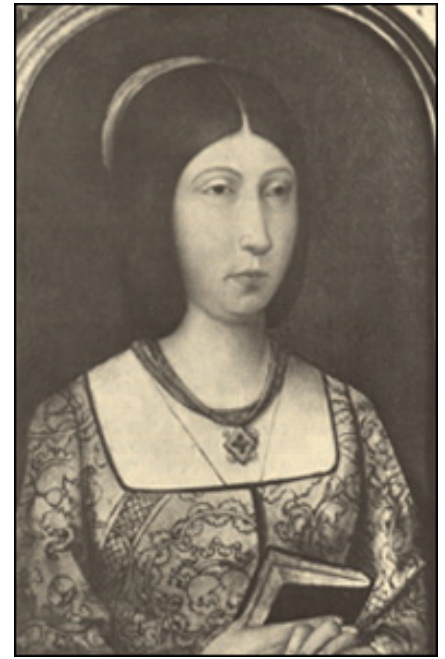
Isabella the Catholic (1451-1504), Queen of Castile and León.

As in the case of the "Invincible" Armada, the Portuguese were partners in crime with the Spanish in the effort to stop the English exploration.