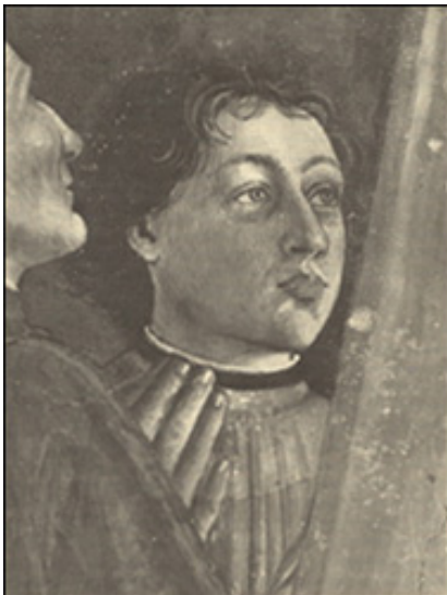
Amerigo Vespucci (1451-1512).