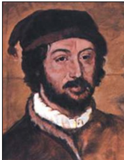
Mapmaker Juan de la Cosa (1460-1510).