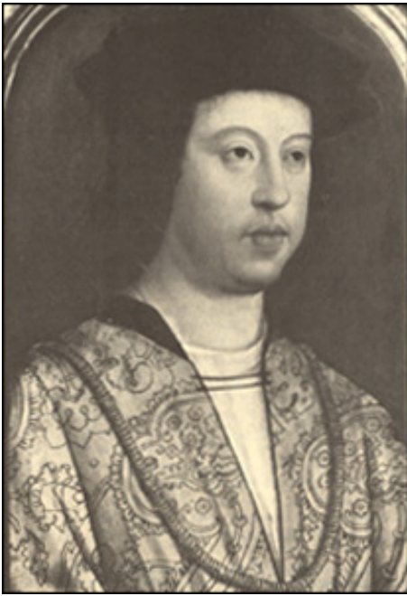
Ferdinand the Catholic (1452-1516), King of Aragón.

Ferdinand and Isabella sent Alonso de Hojeda on a murderous mission to destroy the New World colony of John Cabot.