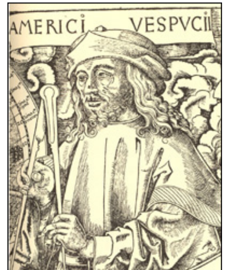
Amerigo Vespucci (1451-1512).