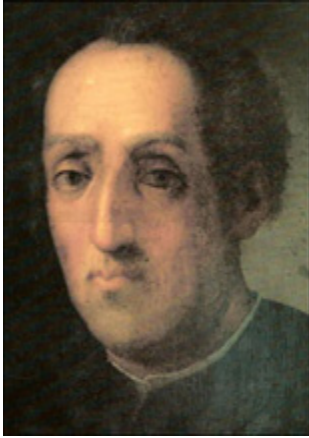
Portuguese Christopher Columbus (1436-1506).

On August 3, 1492, Christopher Columbus set sail from Spain with 3 ships: the Niña, the Pinta and the Santa María. He used the maps and charts of a dead pilot named Alonso Sanchez and arrived on the island of Santo Domingo on Oct. 12. Martin Alonso Pinzón, the captain of the Pinta was the first to land, followed by Vicente Yañez Pinzón, the captain of the Niña.